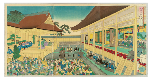
Chikanobu Toyohara: Noh Theater (1881)