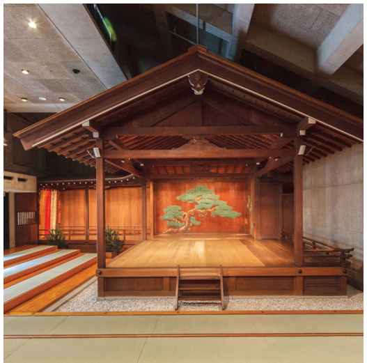
Program precedent: Nippon Kyodo Kikaku Architectural Design Office: Tessenkai Noh Laboratory Theater, Tokyo (1983