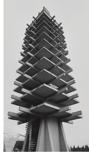
Precedents for urban site: SO&CO; Ando; Azuma; Ashihara